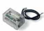
XBA8 Integrable traffic light.