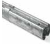
XBA9 Expansion joint.