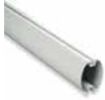
XBA5 White paint-finished aluminium bar 69x92x5150 mm.