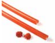
XBA13 Rubber impact protection strip. Length 1 m.