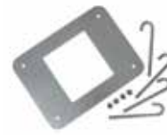
XBA16 Anchorage base with clamps.