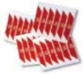
WA10 Red adhesive reflector strips.