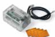
XBA7 Integrable flashing light.