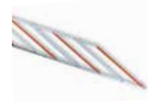
WA13 Aluminium rack up to 2 m.